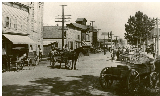
Pig Fair 1908 Cedar Grove, WI