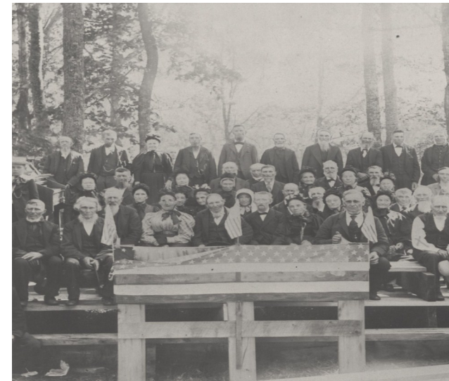
Township of Holland Pioneers, Sheboygan County, WI 50th Anniversary July 1897

Sponsored by the Sheboygan County Historical Research Center